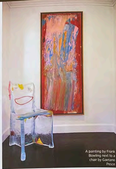
A painting by Frank Bowling next to a chair by Gaetano Pesce