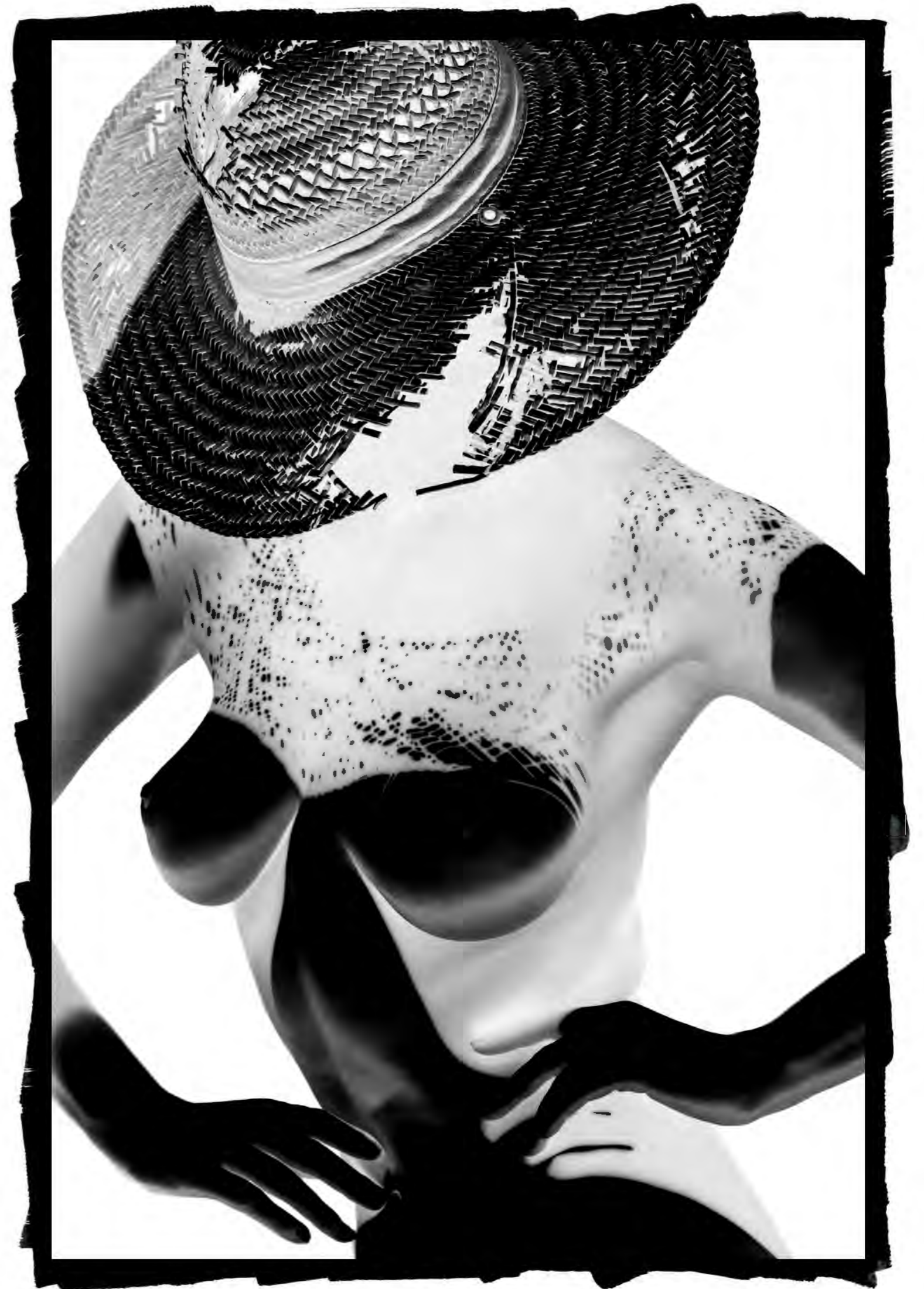
Wildcat Hill VI