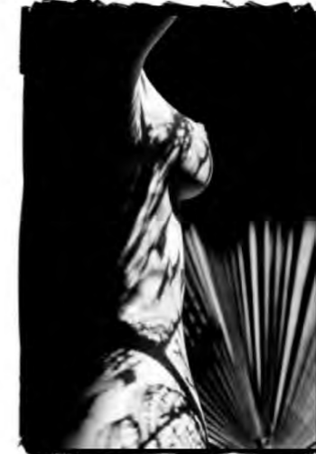
Bodie House II