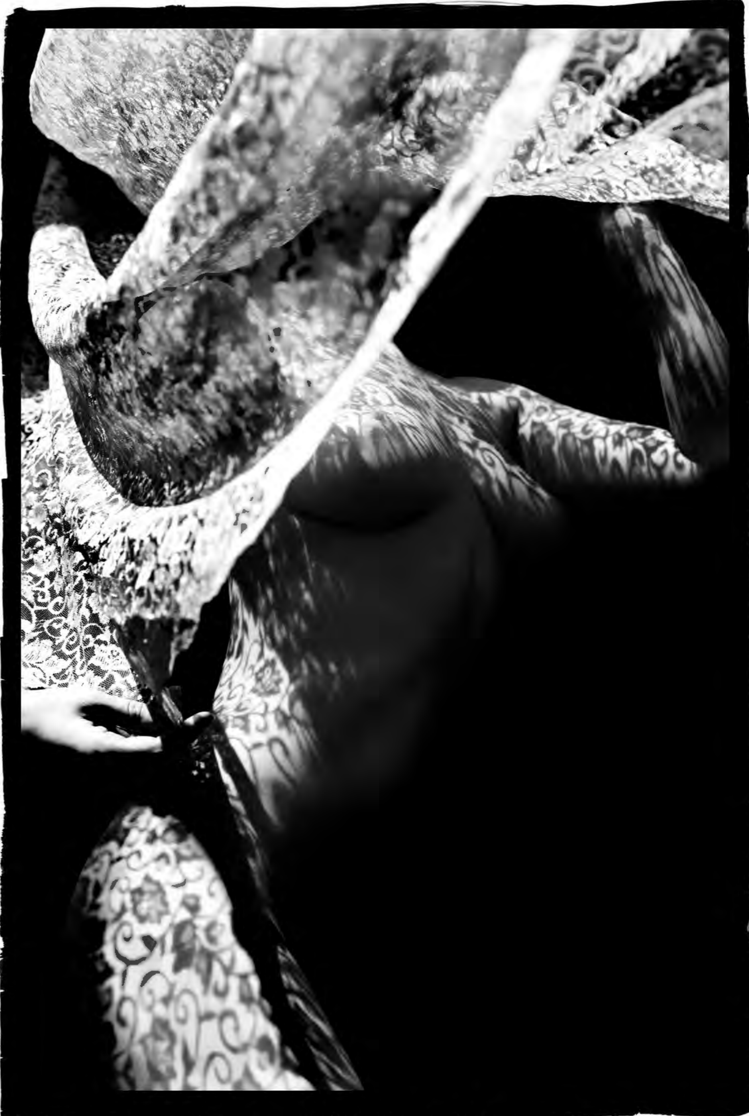
Wildcat Hill I