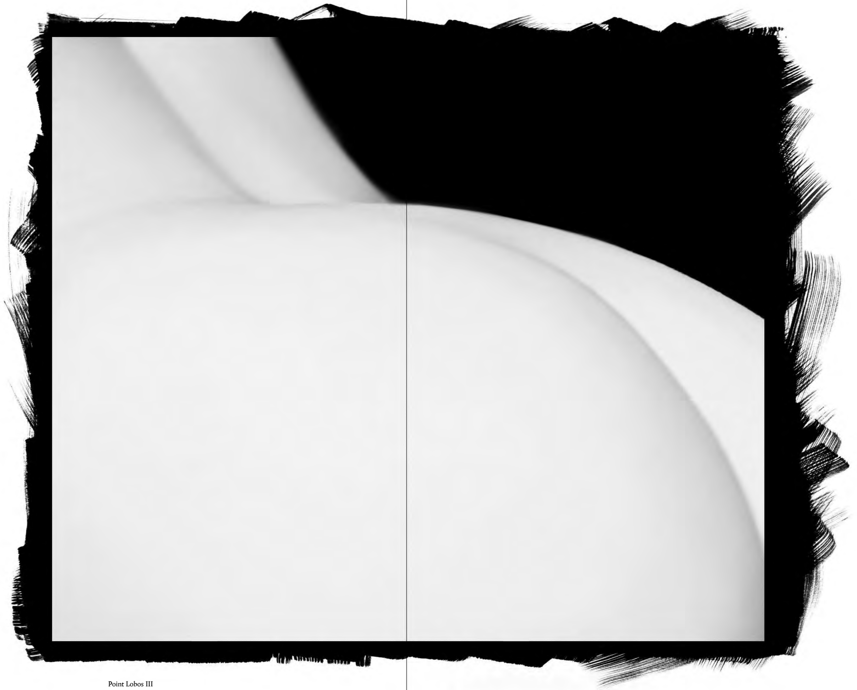
Point Lobos III