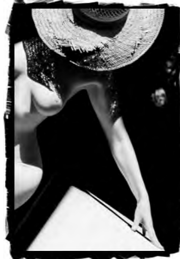
Wildcat Hill III