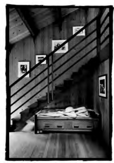
Big Sur II