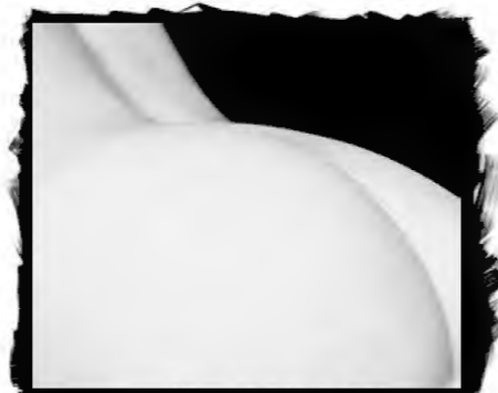
Point Lobos III