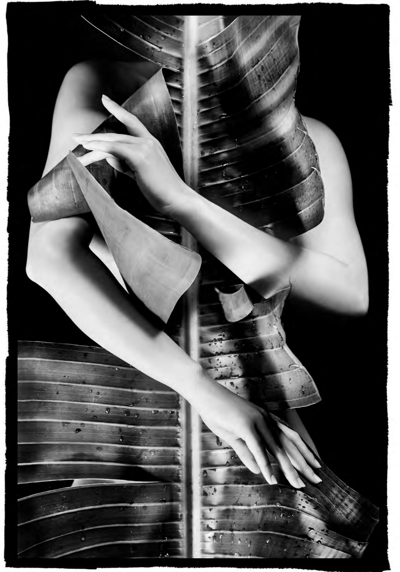
Bodie House IV