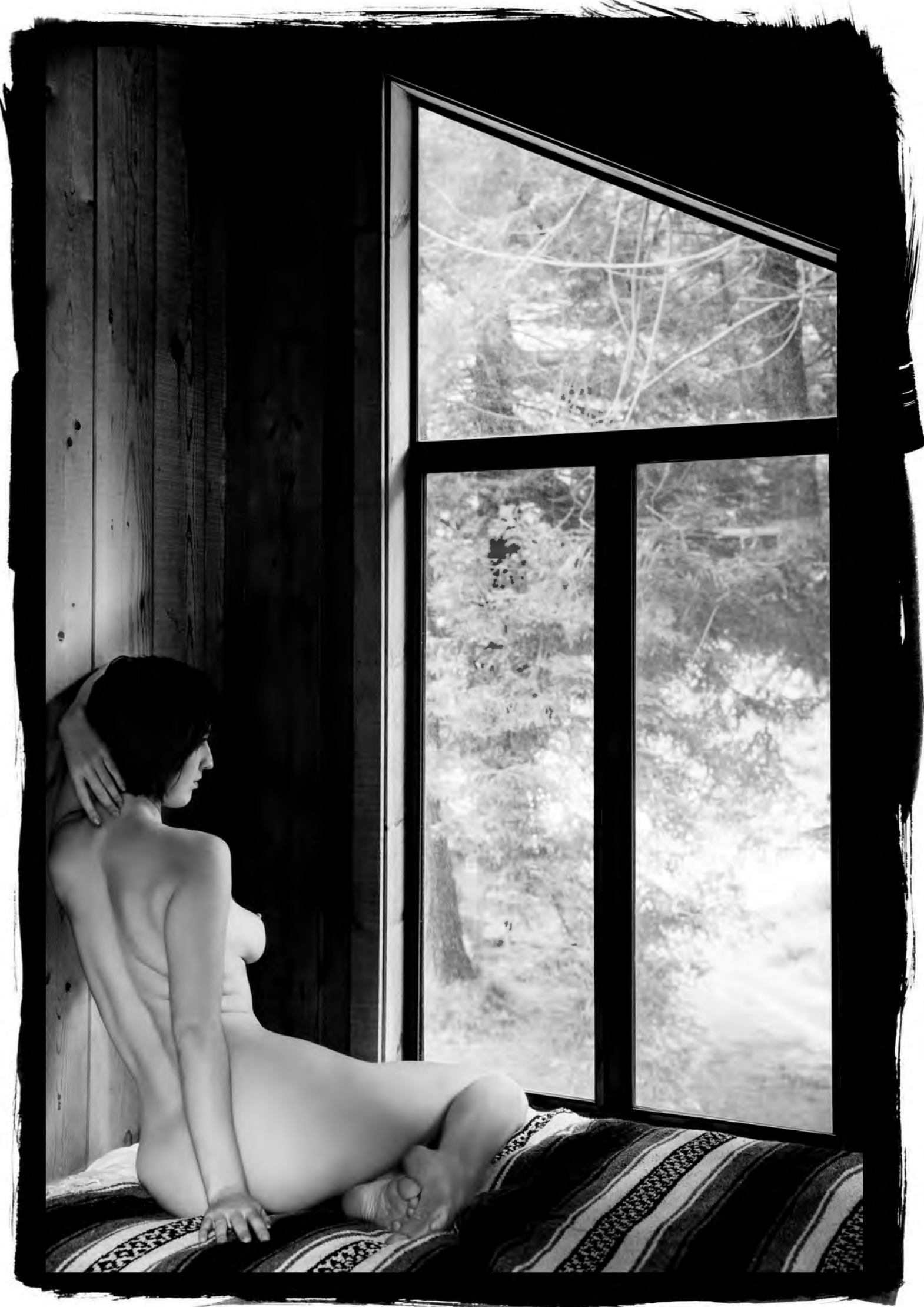
Big Sur III