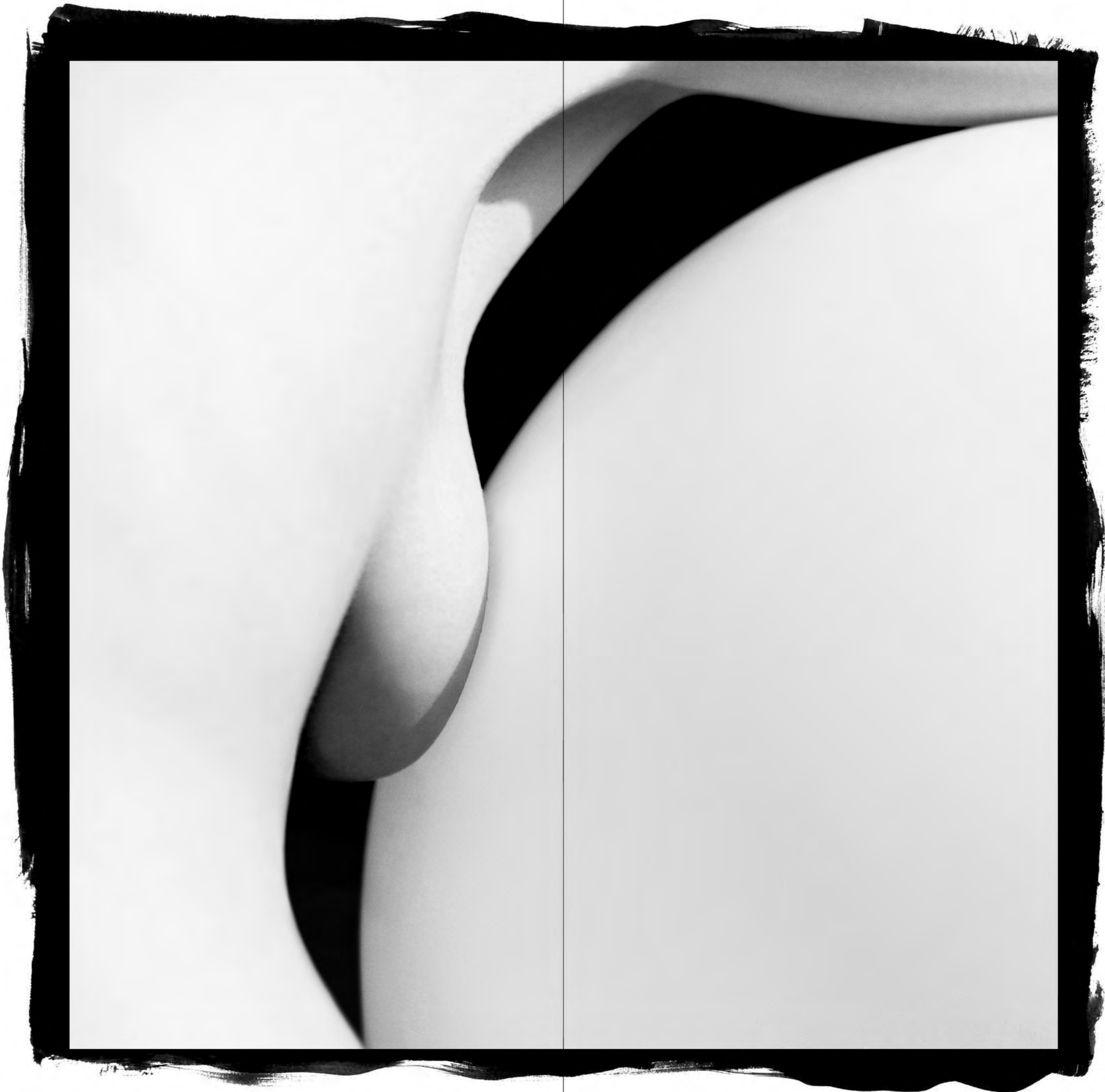
Point Lobos IV