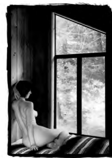
Big Sur III