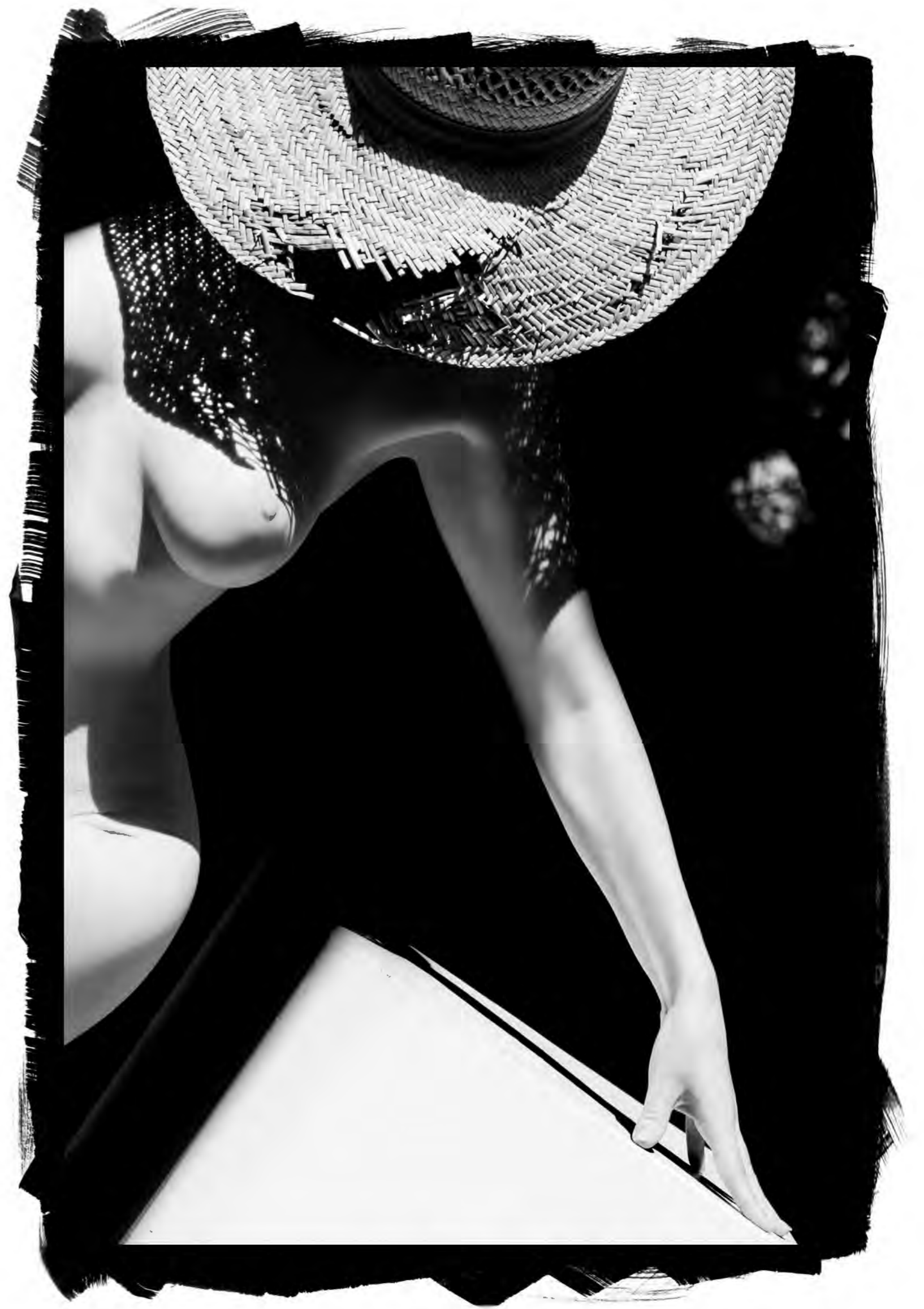
Wildcat Hill III