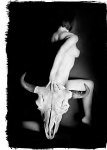
Wildcat Hill V