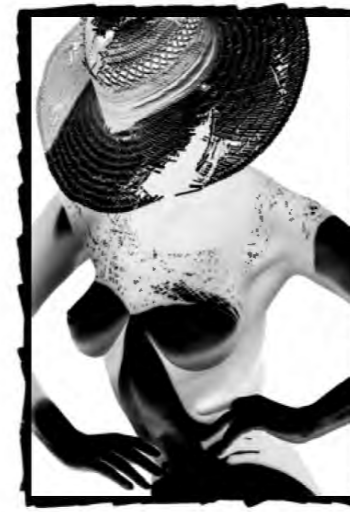
Wildcat Hill VI