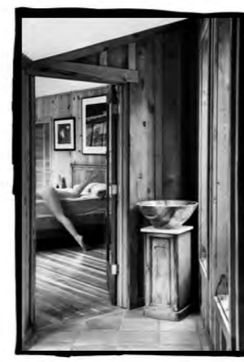
Big Sur IV