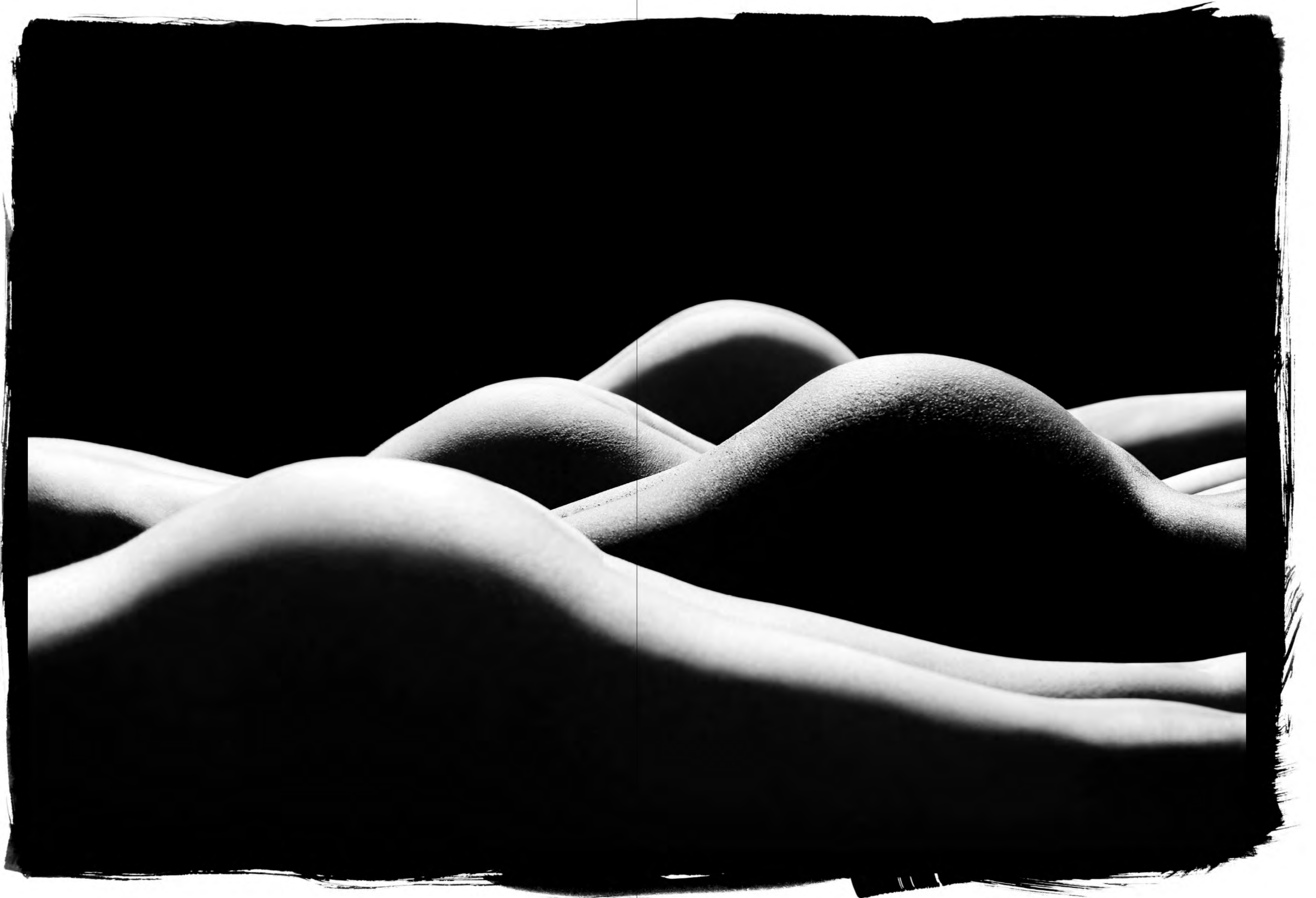
Point Lobos II