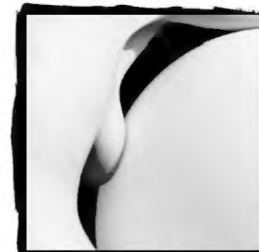
Point Lobos IV