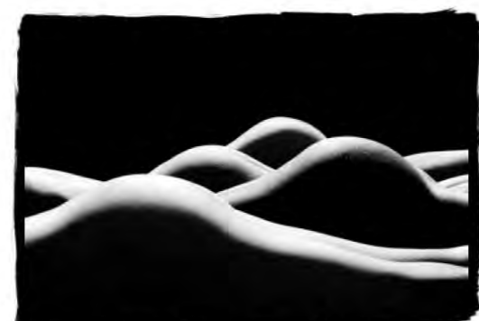
Point Lobos II