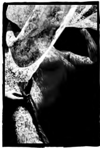
Wildcat Hill I