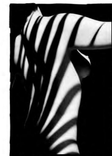
Bodie House III