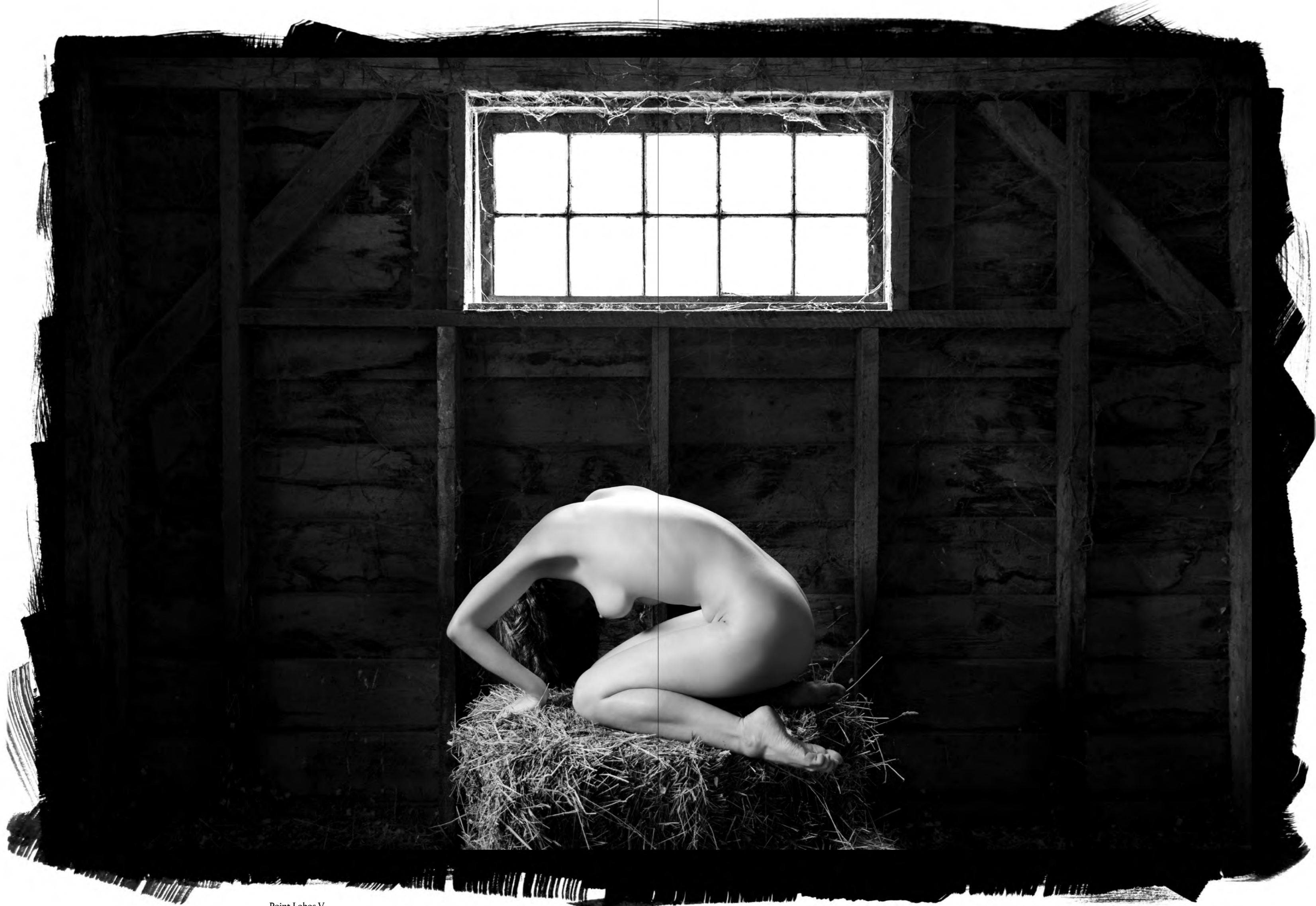
Point Lobos V