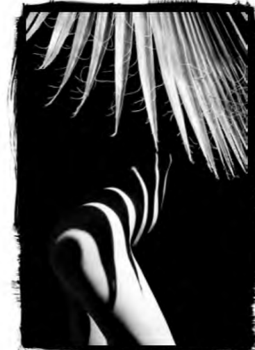
Bodie House I