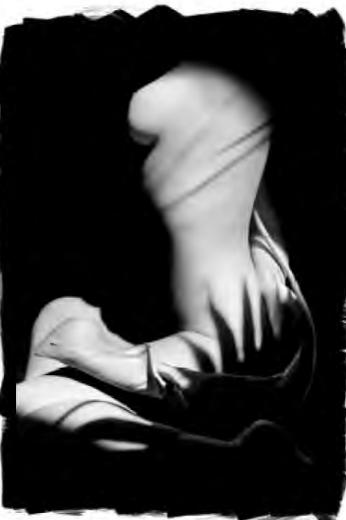
Bodie House V