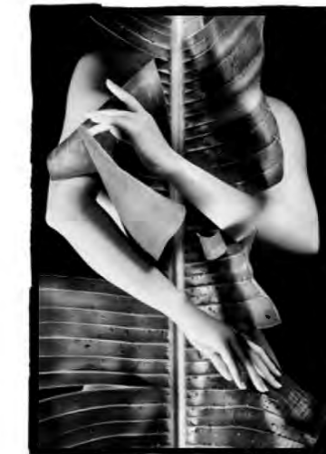
Bodie House IV