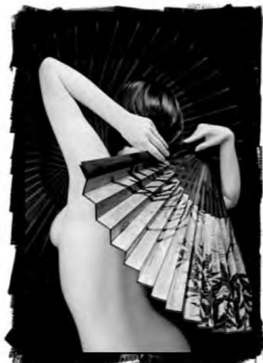
Wildcat Hill IV