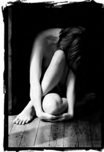
Big Sur I